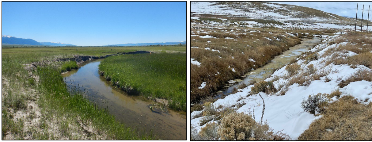
Figure 2. Photo point of Moore Creek illustrating high rates of bank erosion, simplified aquatic habitat conditions, and altered channel geometry (photo left). The existing ditch system intercepts an intermittent stream, springs and seeps, altering wetland hydrology and overall functions and values (photo right).

The project area includes Moore Creek, tributary channels and springs, and prior converted wetlands. Moore Creek has been impacted by livestock grazing, channelization, ditching, and agricultural practices that have led to stream incision, entrenchment, high rates of bank erosion, and compromised aquatic and wetland habitats. In the mid-1900's, a four-mile-long drainage ditch was constructed on the west side of the valley to intercept springs and seeps to drain emergent and scrub-shrub wetlands. The ditch was subsequently plugged to create open water wetlands. These efforts were mostly unsuccessful, and the current ditch system and open water features provide marginal wetland functions and values and continue to alter wetland hydrology.