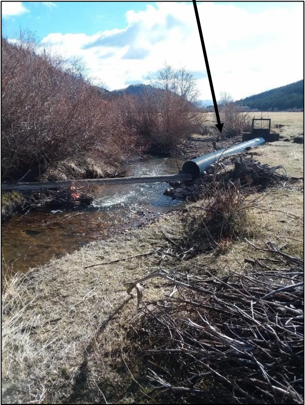
Figure 3. Current status of the point of Diversion.