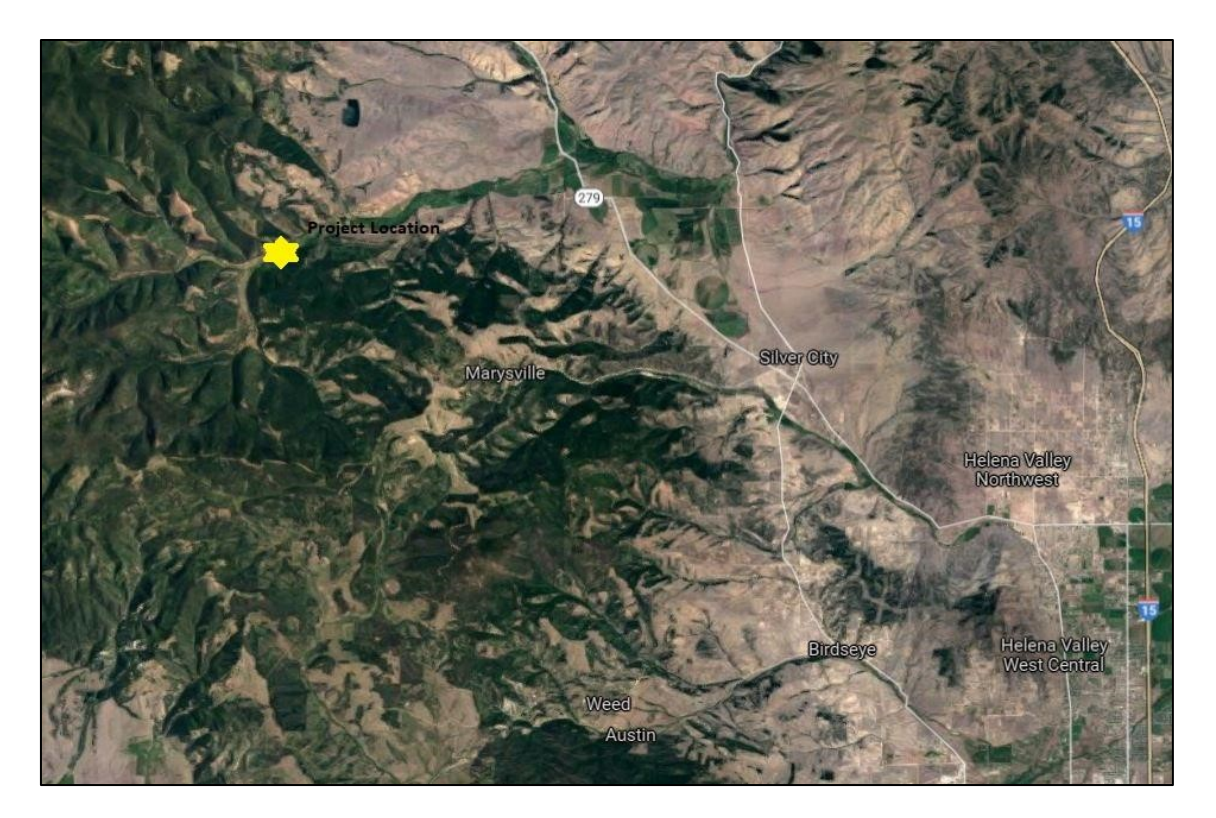
Figure 1. Project location in relation to Helena.