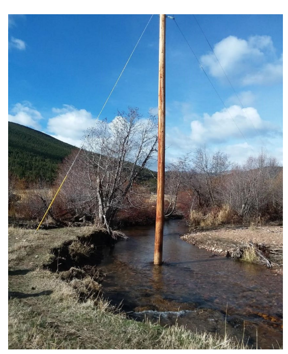
Figure 6. Another example of stream banks in the project area.