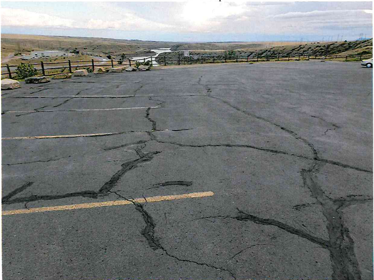
Lewis & Clark main parking lot