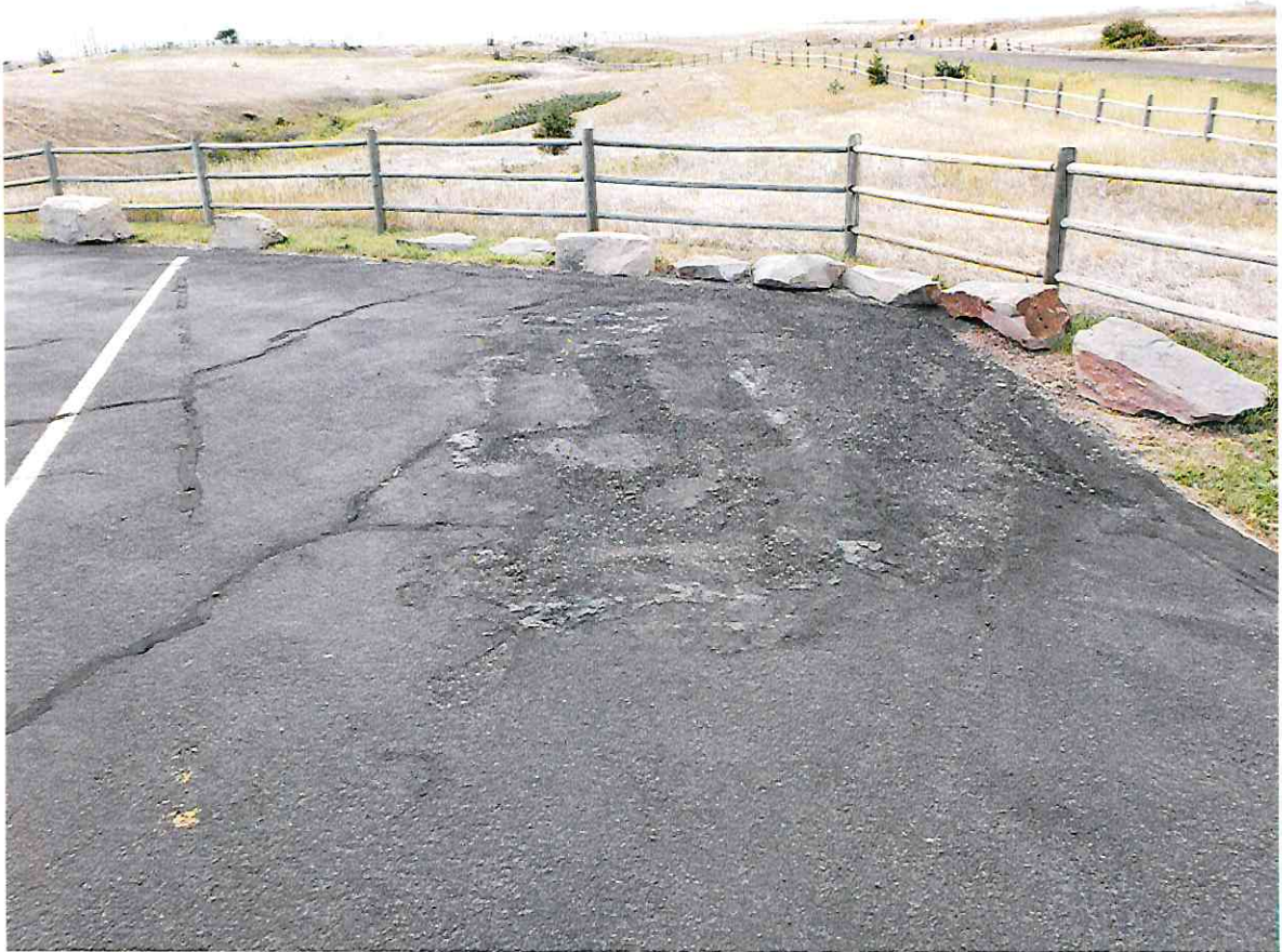
Damaged asphalt from car fire