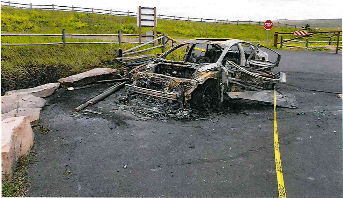
Burned car in Rainbow Overlook