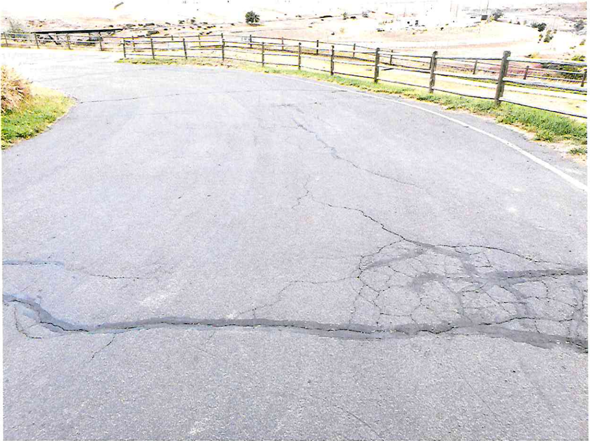
Lewis & Clark loop