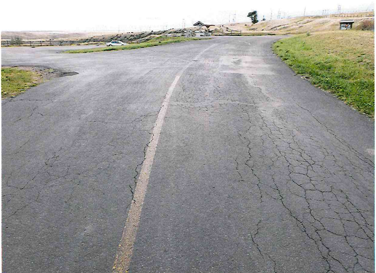
Lewis & Clark entrance looking southwest