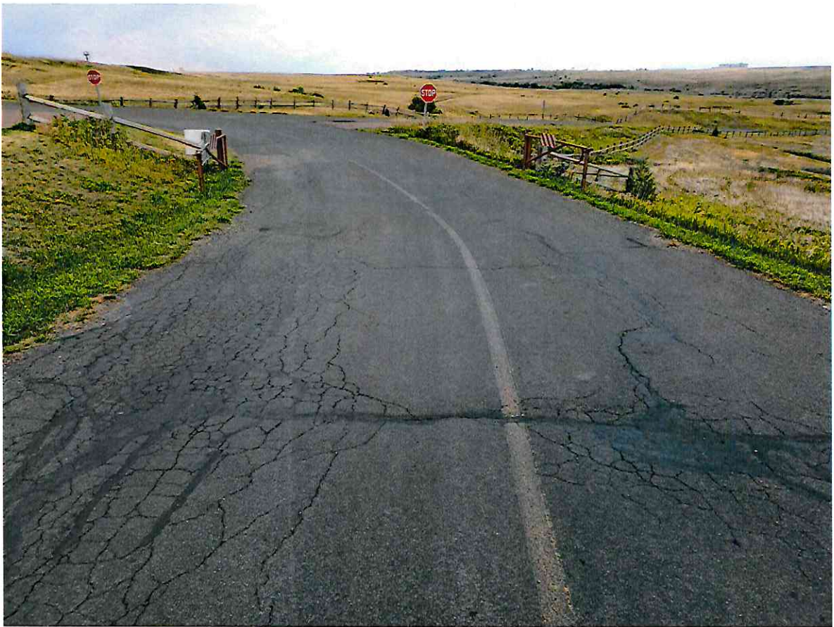
Entrance to Lewis & Clark