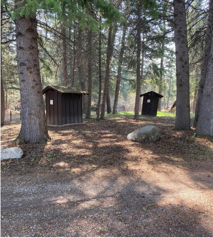
West Fork Campground vault toilets. Camera is level. Toilets are not.