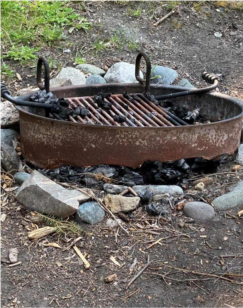
West Fork Campground fire ring