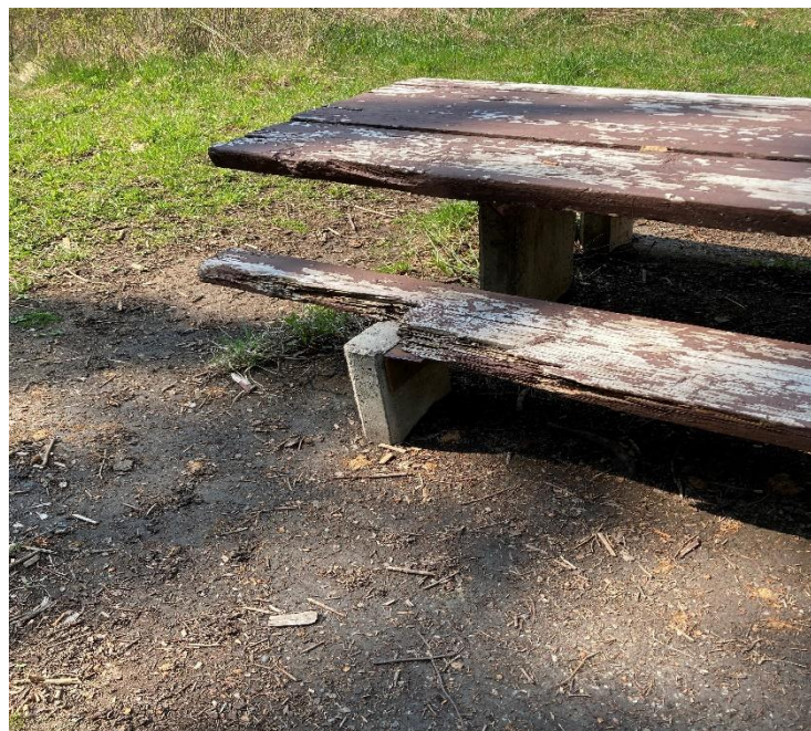
West Fork Campground picnic table