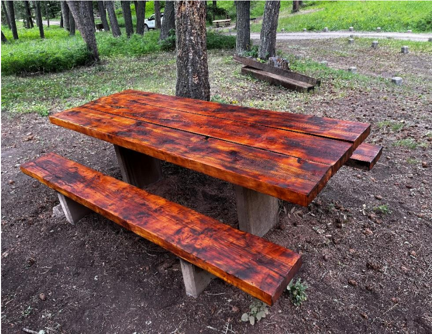
Proposed new picnic table!!!