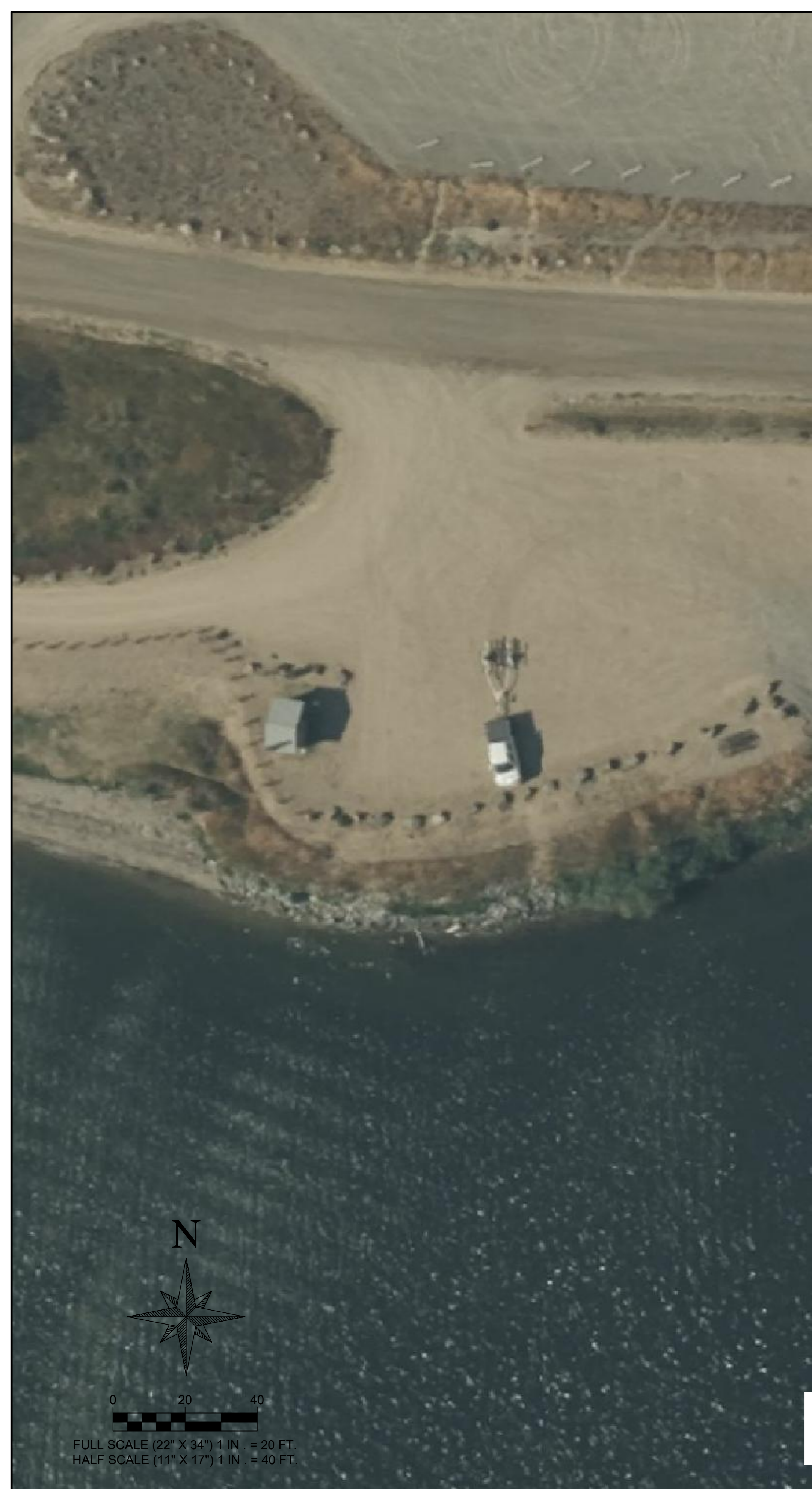
C:\USERS\GANDERSON\ONEDRIVE - DOI\DOCUMENTS\PROJECTS\RIVER FUND PROJECTS\2023\KOBIYASHI DOCK\06_IMPROVEMENT SHEETS\KOBIYASHI DOCK - SITE.DWG